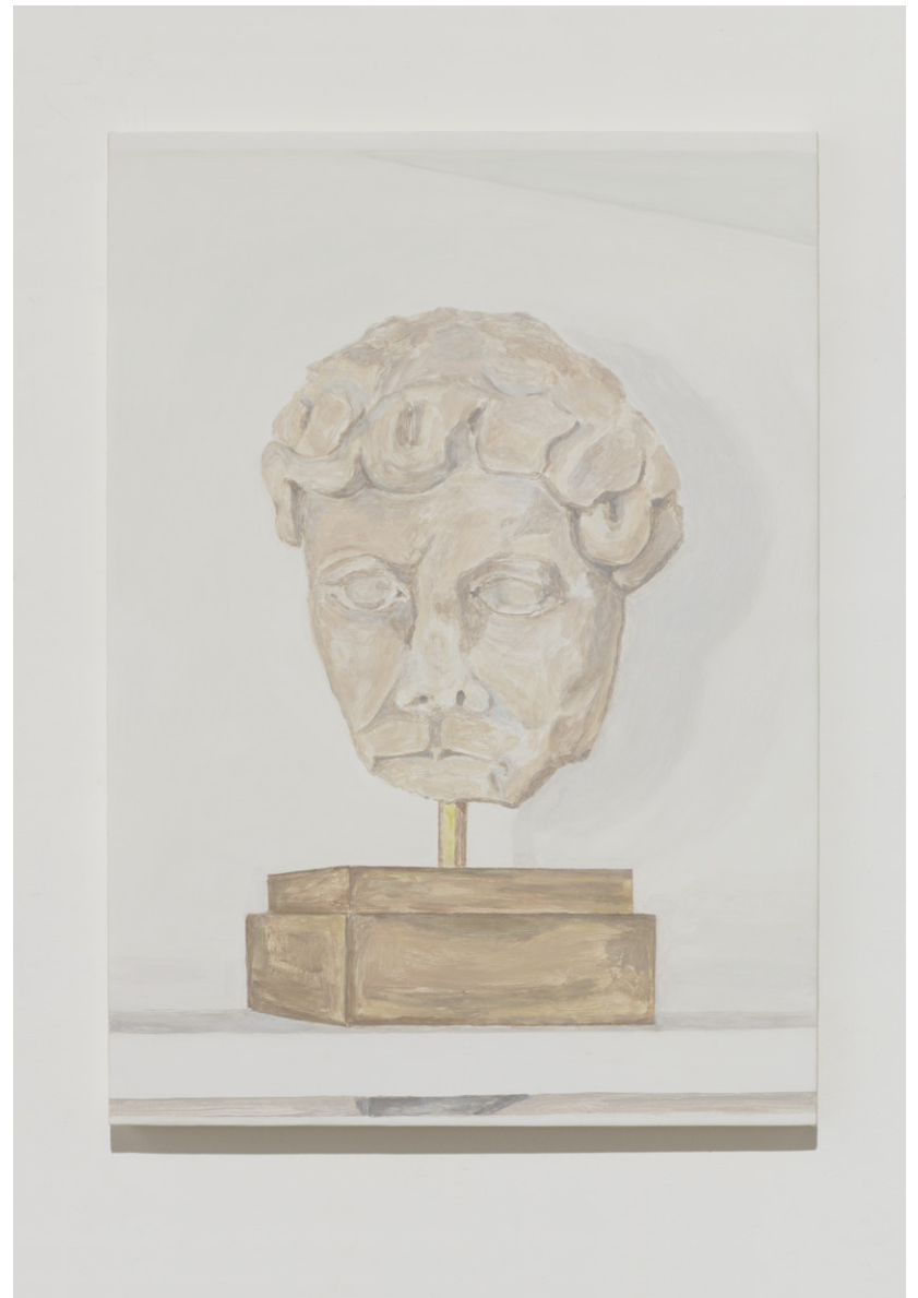
Hadrian , 2020 Acrylic on canvas 29 ½ × 21 inches