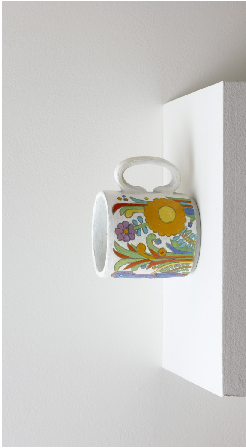
Acapulco Mug , 2021 Fired clay and oil paint 3 ½ x 4 ½ x 3 ¼ inches