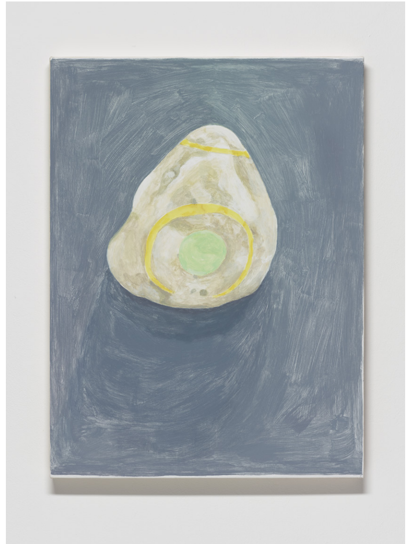
Painted Rock (yellow/green) , 2021 Acrylic on canvas 25 × 18 ¾ inches