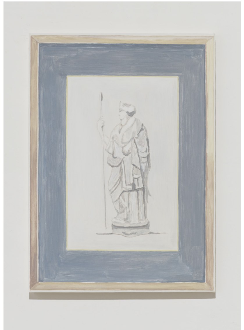
Hera , 2020 Acrylic on canvas 32 × 23 inches