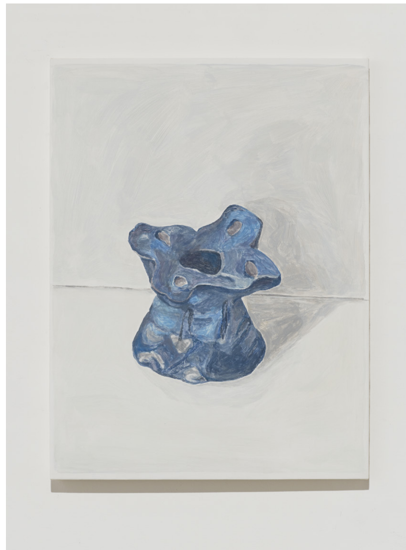
Candlestick , 2019 Acrylic on canvas 31 × 23 ½ inches